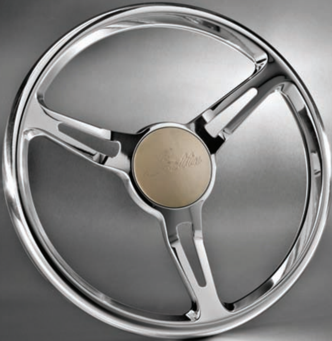
version without inserts

DIAMETER: ø 350mm - 13.80" GRIP AND SPOKES: Full made in stainless steel SS316 polished. Available with or without spokes inserts (painted or genuine/vinyl leather). Back grip side painted or genuine leather or vinyl leather. CENTRAL CAP: Painted, genuine leather or vinyl leather. OPTIONS: Central cap with custom logo embossed.