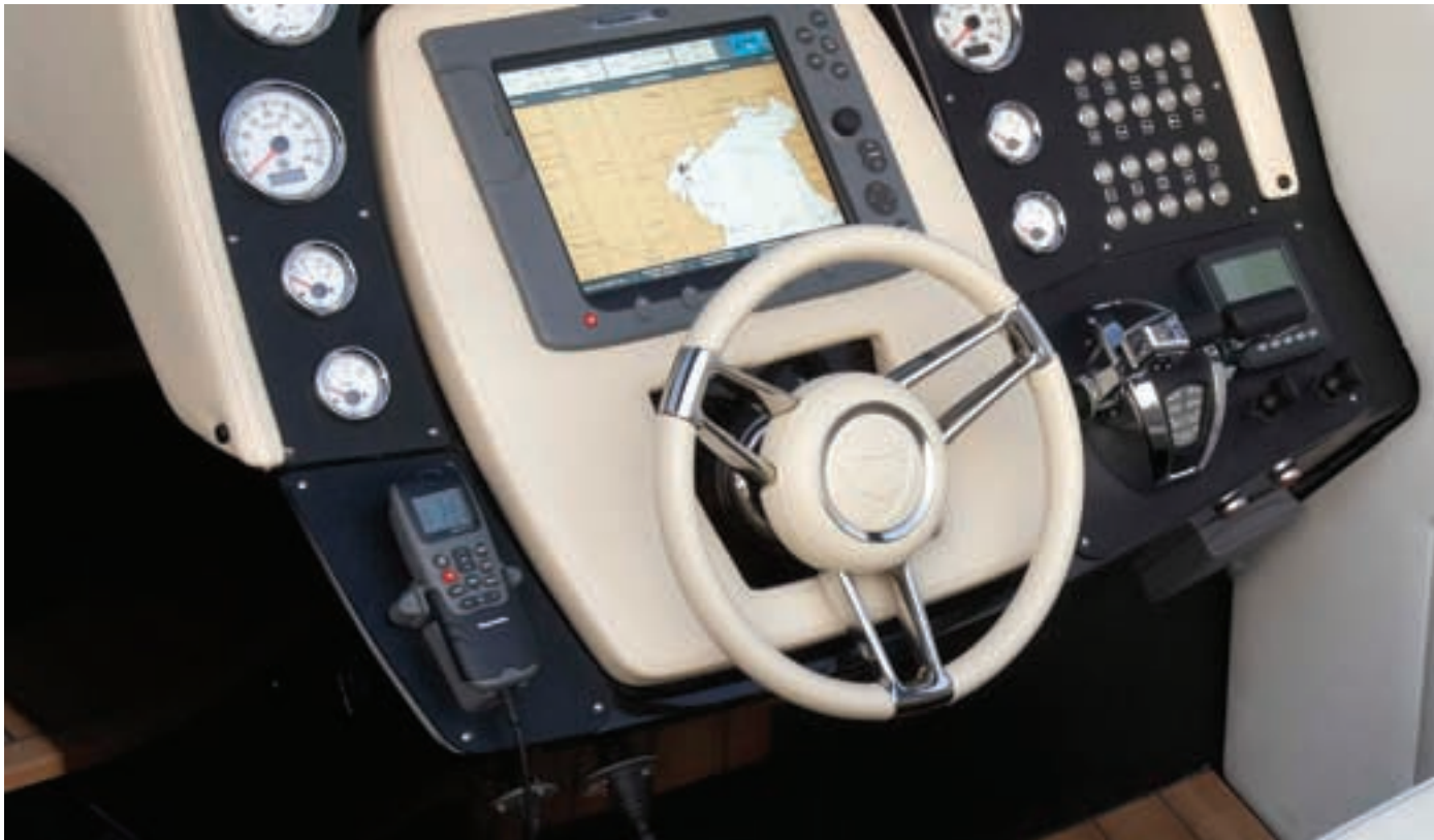
MEDELANA steering wheel in avory colour for "Lancia di Lancia" by SACS Marine

Thanks to these choices we can boast of partnerships with some of the most prominent shipyards in the world.